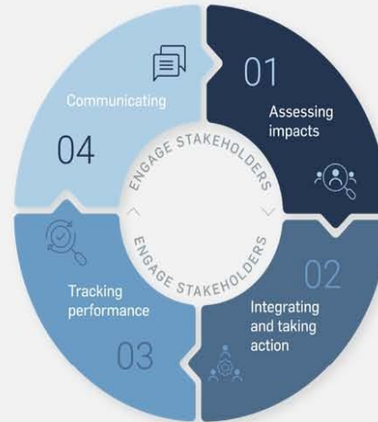
THE HUMAN RIGHTS DUE DILIGENCE PROCESS

According to the ILO Tripartite Declaration of Principles concerning Multinational Enterprises and Social Policy (MNE Declaration), the due diligence process, as it concerns workers' human rights, should "involve meaningful consultation with potentially affected groups and other relevant stakeholders including workers' organizations". 21 According to the MNE Declaration, this process should "take account of the central role of freedom of association and collective bargaining as well as industrial relations and social dialogue as an ongoing process". 22